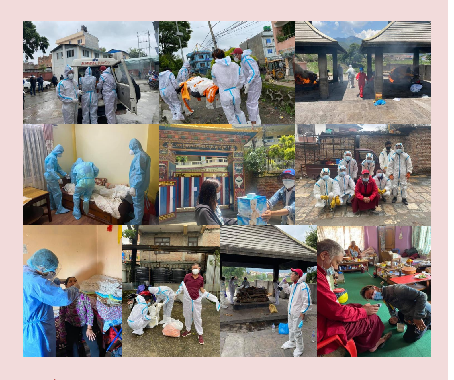
5) FUNERAL SERVICE OF THE COVID PATIENTS ALONG WITH PROVIDING OXYGEN SOURCES DEVICES, MONITORING DEVICES AND FREE PCR